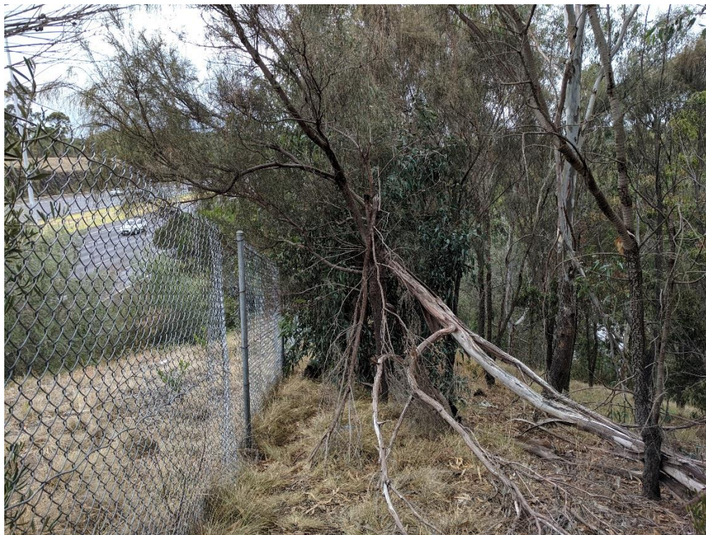
Figure 2: Proximity of freeway on the left to the Yarra river on the right (Note the fence has been cut in this location for many years).