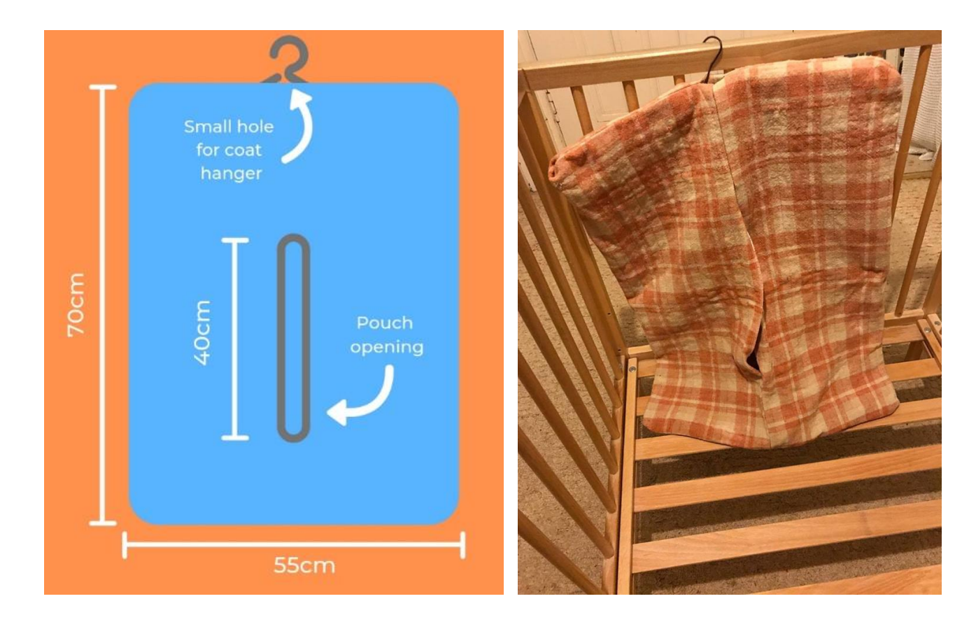
Please note: Measurements are approximate – a variety of sizes are required and appreciated, get creative!

Material: Blankets, polar fleece or old electric blankets